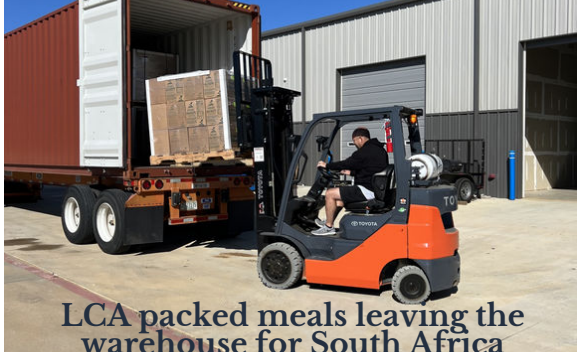
LCA packed meals leaving the warehouse for South Africa

We are looking ahead to our spring Feed the Need fundraiser, but have an exciting update regarding last year's campaign. Last year we packed over 10,000 meals for needy children. Because of unrest in Haiti (relief aid/food is being held hostage at the border as the government is demanding bribes to release it), our meals were rerouted to Durban, South Africa, where there are ministry partners helping feed and share the Gospel with kids & families. Feed The Hunger remains committed to serving the people of Haiti, but want to ensure the meals' safe arrival. This coming season, meals will be packed and sent to the largest refugee camps in Bangladesh.