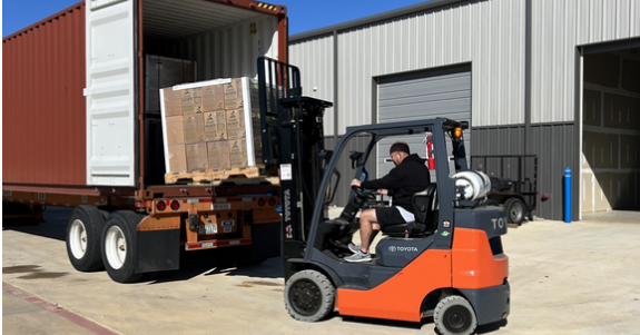
LCA packed meals leaving the warehouse for South Africa

We are looking ahead to our spring Feed the Need fundraiser, but have an exciting update regarding last year's campaign. Last year we packed over 10,000 meals for needy children. Because of unrest in Haiti (relief aid/food is being held hostage at the border as the government is demanding bribes to release it), our meals were rerouted to Durban, South Africa, where there are ministry partners helping feed and share the Gospel with kids & families. Feed The Hunger remains committed to serving the people of Haiti, but want to ensure the meals' safe arrival. This coming season, meals will be packed and sent to the largest refugee camps in Bangladesh.